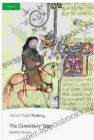
Image Alt: Cover of the book Canterbury Tales Kpf with Integrated Audio Pearson English Graded Readers, featuring an illustration of the pilgrims on their journey to Canterbury.