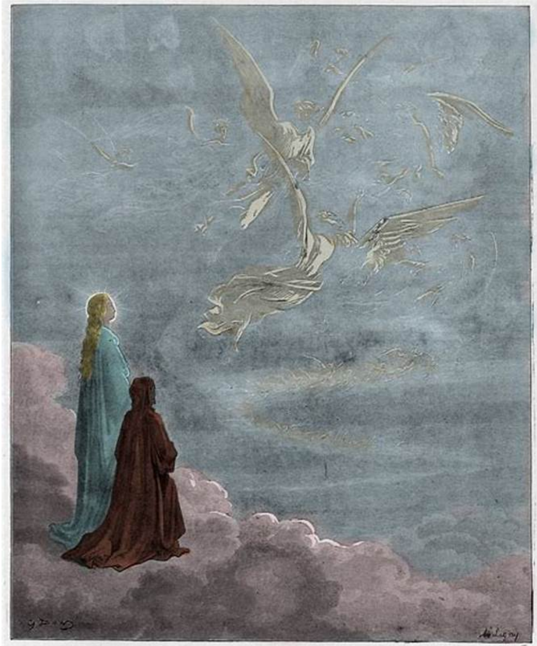
Gustave Doré's illustration of Dante and Beatrice in Paradiso