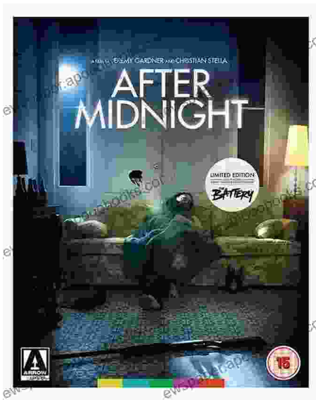
Book cover of Life in the ER After Midnight