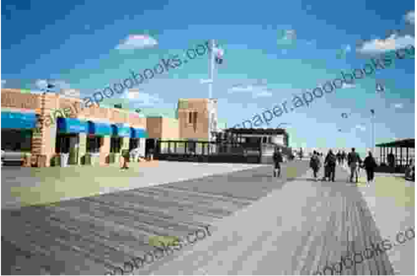
Jones Beach State Park

Stretching along the Atlantic Ocean, Jones Beach State Park is a beloved destination for sunseekers, swimmers, and surfers alike. Its six miles of pristine sand, clear blue waters, and ample amenities make it the perfect place to escape the summertime heat and enjoy a day by the shore.